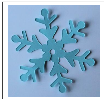
Step 5: Center punched hole with slit.

Step 5: Add decoration to the bow by slipping the large snowflake diecut behind the bow. Tip: Punch a 1/4" hole directly in the center of the snowflake and cut a slit up to the hole. You can now slip the snowflake behind the bow! Refer to photo below. Add a wood snowflake and button for additional interest. Add a charm as another embellishment.